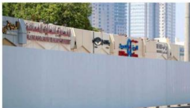
Shops and restaurants in Mina Zayed which are due for demolition.

► Scores of old restaurants, cafes and shops are set for redevelopment