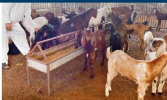
The Abu Dhabi Livestock Market in Mina Zayed. Traders said animals from overseas are being brought in by air as they cannot be shipped due to the hot and humid weather.

This website stores cookies on your computer. These cookies are used to improve your personalized service to you. Both on your website and other media. To find out more check out our Privacy Policy .