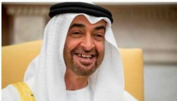
Sheikh Mohamed bin Zayed, Crown Prince of Abu Dhabi and Deputy Supreme Commander of the Armed Forces, unveiled Ghadan 21, a Dh50 billion stimulus programme, last June.

► The Crown Prince announced Dh50 billion reforms for Abu Dhabi last June