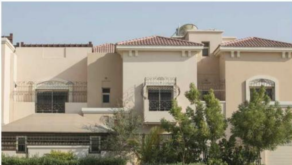
The number of loans issued to Emiratis to build new homes in 2019 has doubled this year under Ghadan 21.

A five-year retirement visa was also created for residents over 55 with a property worth at least Dh2 million, savings of Dh1 million, or a minimum monthly income of Dh20,000.