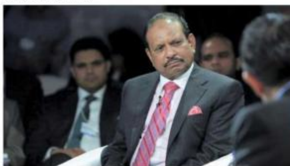
Yusuff Ali, chairman and managing director of Lulu Group International

► Our readers have their say about Golden Cards, UAE heritage sites, peace in the Middle East and Mo Salah